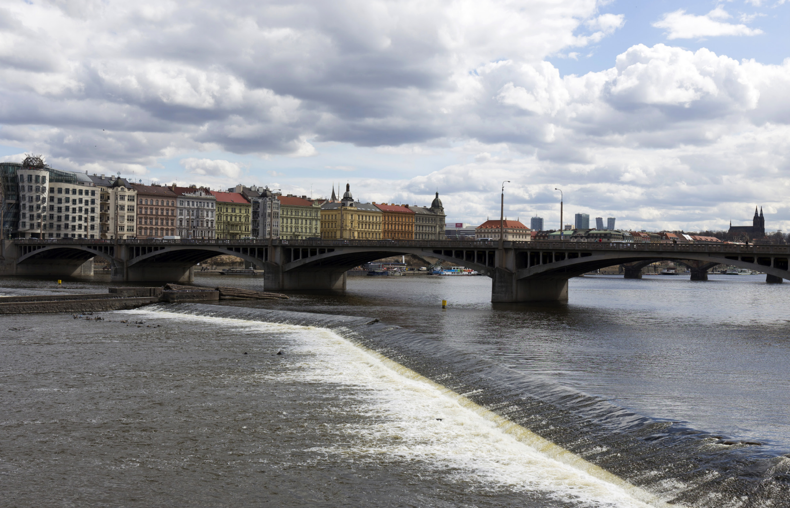
View on the spring Prague City above River Vltava, Czech Republic. 2021.