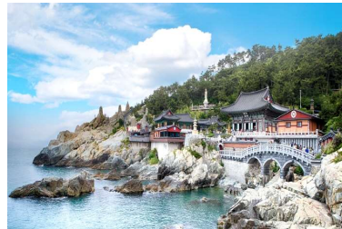
Haedong Yonggungsa Temple