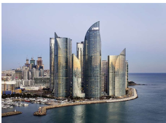
Haeundae Udong Hyundai I' Park