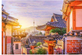
Bukchon Hanok village